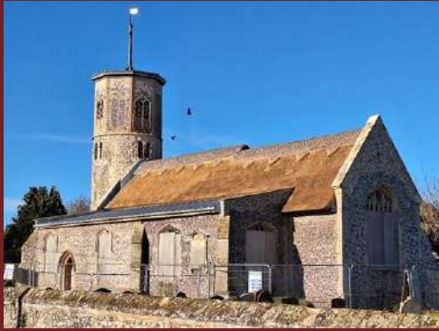
St. Mary's, Beachamwell