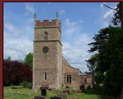
All Saints' Wretton with Stoke Ferry