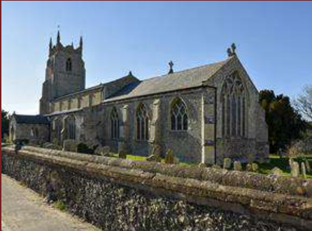
St. Mary's, Feltwell