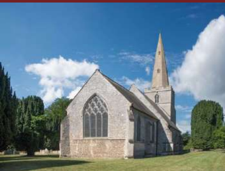
St. James', Hockwold