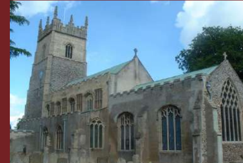
St. Andrew's, Northwold