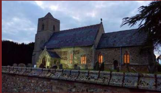
St. Andrew's, Barton Bendish