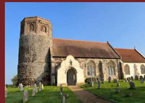
St. Andrew's, West Dereham