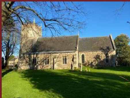
St. Margaret's, Wereham