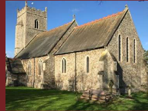
All Saints, Boughton