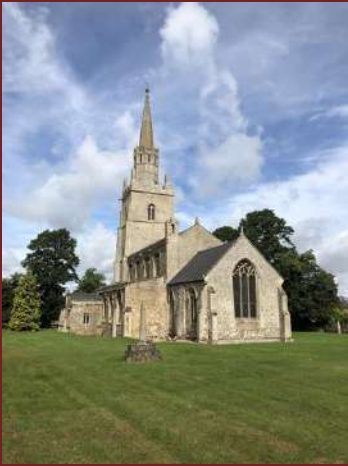
St. George's, Methwold