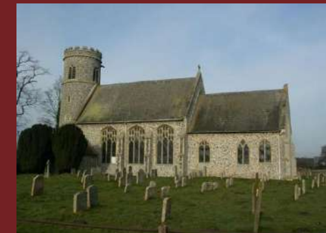
Weeting St. Mary