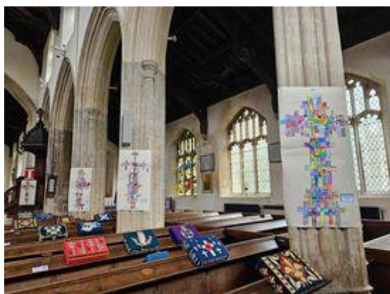
Children's work in church for Easter and Remembrance Sunday