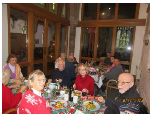
The Lunch Bunch