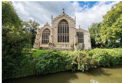
St Clement's, Outwell