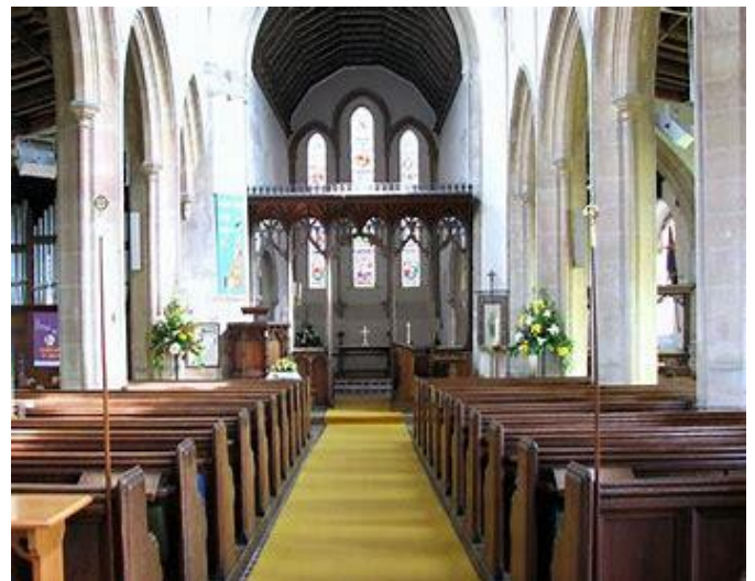
St Edmund's Church Emneth