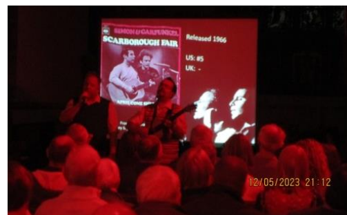
'Simon & Garfunkel' in action