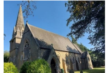
St Mark's, Friday Bridge