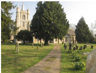
All Saints', Elm