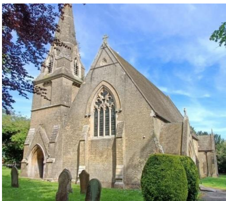
Front view of St Mark's church