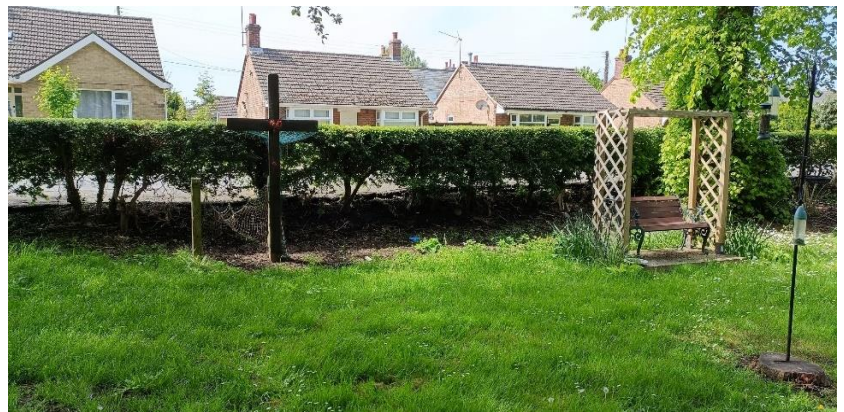
Churchyard cross and arbour