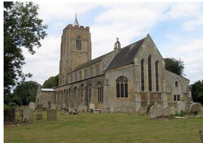
St Edmund's, Emneth