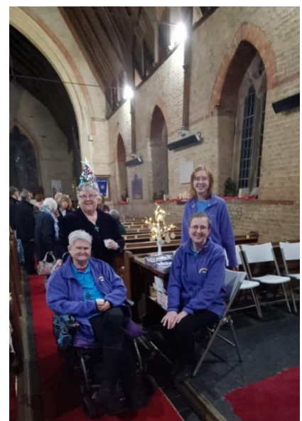
The Open The Book Team