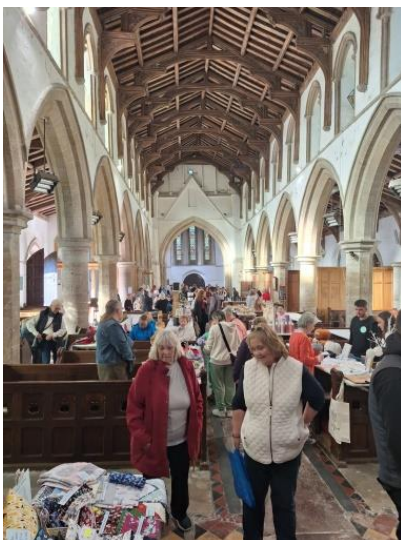
Craft & Food Fayre