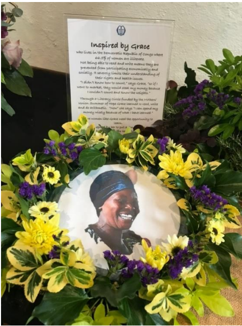
RE: Mothers' Union Summer of Hope