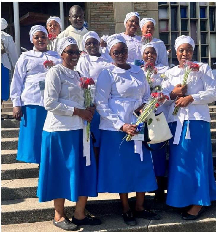
Celebrations in Lusaka, Zambia, as new members were enrolled at a service in the Cathedral. They do look happy.