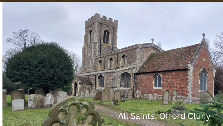
All Saints, Offord Cluny