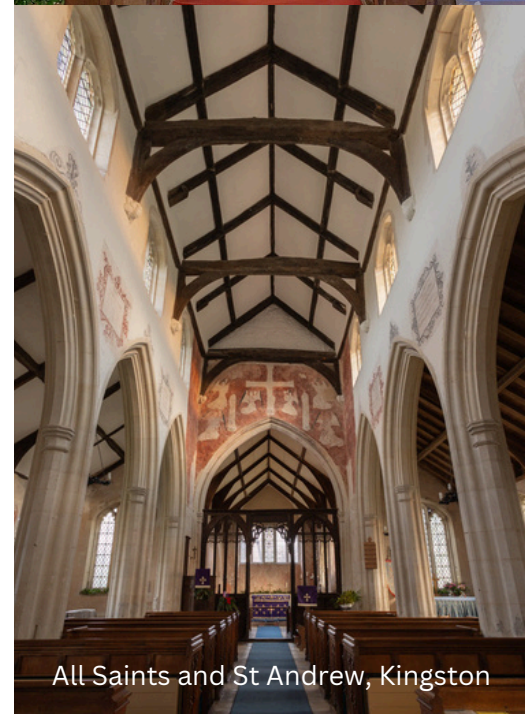
All Saints and St Andrew, Kingston