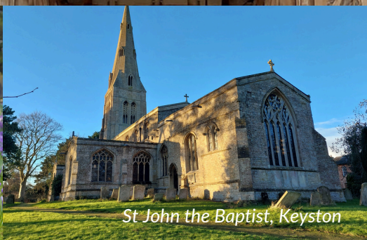
St John the Baptist, Keyston