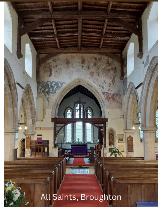
All Saints, Broughton