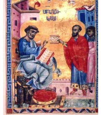
A painting of Luke writing down the words of St Paul.

There are many dates in the Church calendar that celebrate special people who in the past were noted for their faith in Jesus. They have often been given the title of Saint (St). One such person was a man called Luke, whose special day is October 18 th . He is believed to have been a doctor, who collected the stories of Jesus life and work from those who had known him, possible even his mother Mary when she was an old lady. He wrote down all the information he collected in the book in the Bible called the Gospel of Luke, as well as the one about the Acts of the Apostles.