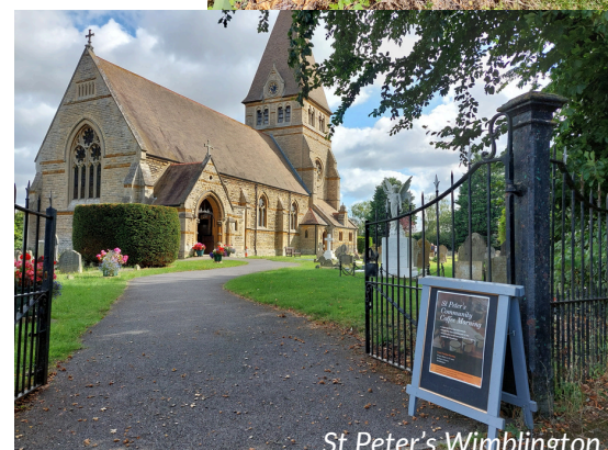
St Peter's Wimblington