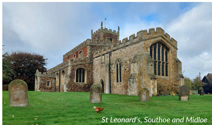
St Leonard's, Southoe and Midloe