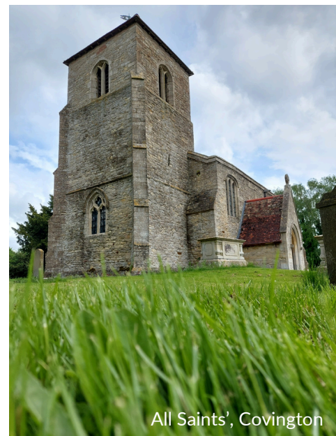
All Saints', Covington