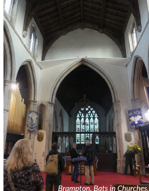
Brampton, Bats in Churches.