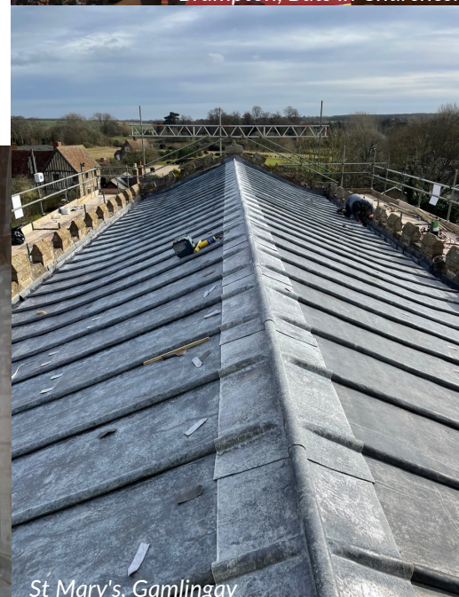
St Mary's, Gamlingay

Please share with us your good news stories. They could be about building projects, events, a new guidebook or display or other ways to draw people to your church.