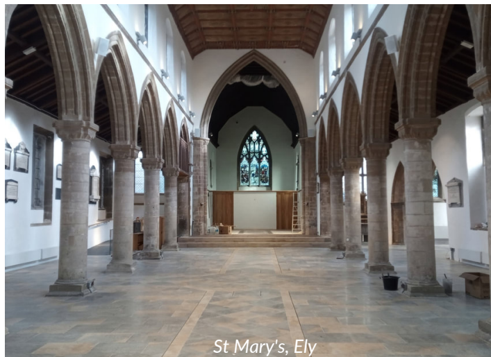
St Mary's, Ely

Please share with us your good news stories. They could be about building projects, events, a new guidebook or display or other ways to draw people to your church.