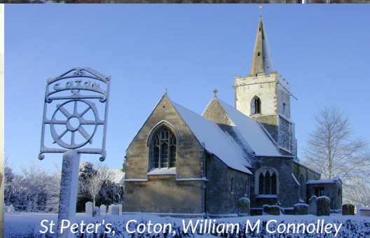
St Peter's, Coton