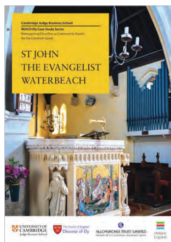
REACH Ely Case Study

Prior to the pandemic, the Project had undertaken 40 case studies of a range of churches in the Diocese as a preliminary to the Audit of Church Buildings and Communities. Despite the number of church buildings that remained closed for much of 2021, 73% of churches managed to submit a response to the Audit for which we are very grateful. This information has given us important insights into the place our churches hold within their communities.