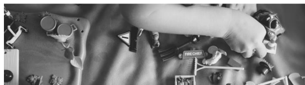
Welcome to the Church of England National Safeguarding Team's online learning portal.

To help people navigate the system we have created an information page providing a step by step guide for using the system . If anyone continues to have logging in issue they need to contact the Training Portal helpdesk via the following e-mail address elearning@mail.safeguardingtraining.cofeportal.org .