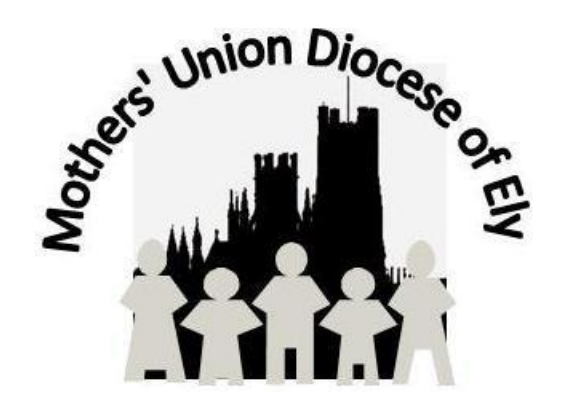
Registered Charity No. 251394