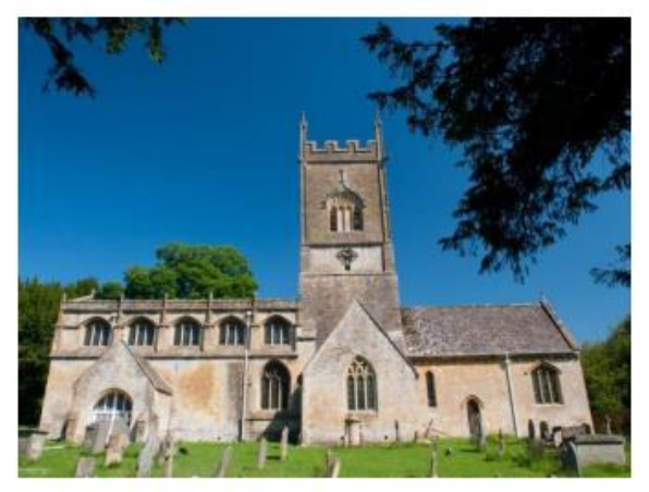
St Michael All Angels Withington The Church of England's first net zero carbon church in the modern era