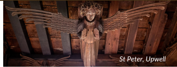
St Peter, Upwell

The National Lottery Heritage Fund is currently closed to applications. A new application process is due to open in January 2024.