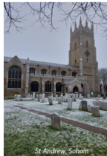
St Andrew, Soham

From theft to arson and vandalism, security is key. As every place of worship and its location is unique, a tailored assessment and response, reflecting the individual risks faced, should be undertaken.