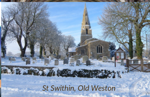
St Swithin, Old Weston