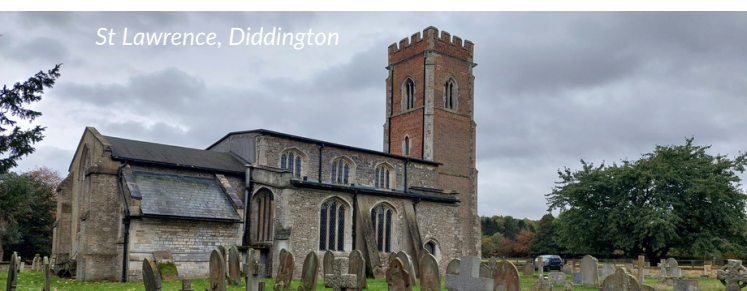
St Lawrence, Diddington