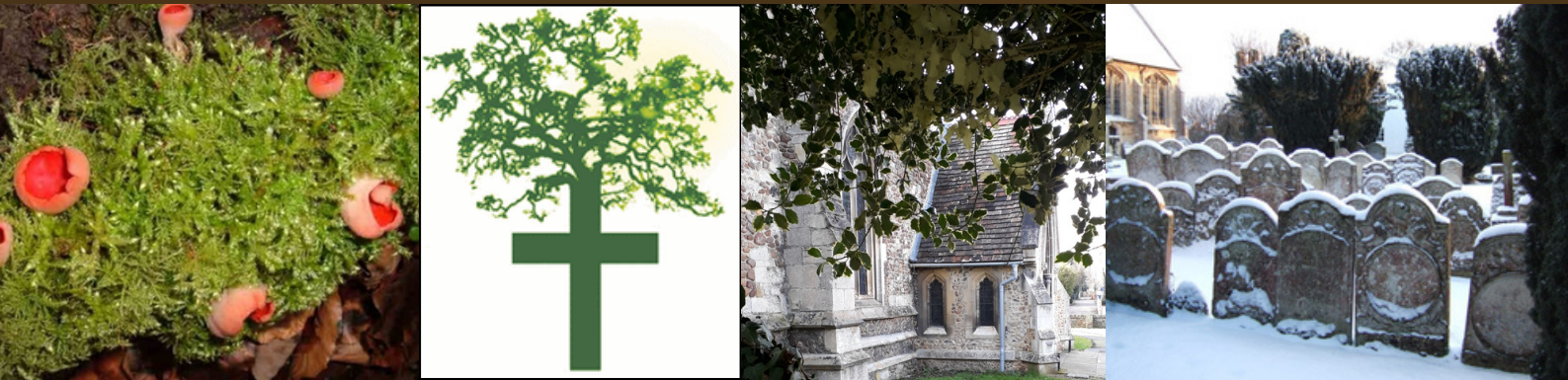
From left to right: Scarlet Elf Cup ; Church Times Green Church Awards; St Mary, Eynesbury; Wisbech St Mary.